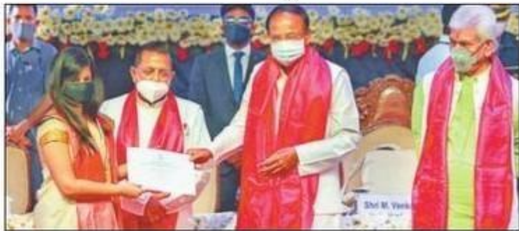
जम्मू में आईआईएम के दीक्षांत समारोह में छात्रा को डिग्री देते उपराष्ट्रपति।

जम्मू कनाल रोड स्थित कन्वेंशन हॉल में समारोह में उप राष्ट्रपति ने उच्च शिक्षा को नई दिशा की ओर उन्मुख करने की जरूरत पर बल दिया। नवाचार और संस्थागत सुधार के लिए प्रोत्साहित करने के साथ रचनात्मकता को बढ़ावा देने के लिए कहा। छात्रों को संबोधित करते हुए उन्होंने कहा कि हमें ऐसा काम करना होगा, जिससे समाज के हर तबके के जीवन में बदलाव आए। उन्होंने कहा कि जम्मू-कश्मीर प्राचीन काल से ही शिक्षा के एक महत्वपूर्ण केंद्र के रूप में जाना जाता है। इस धरती ने पंतजलि, आनंदवर्धन, हब्बा खातून