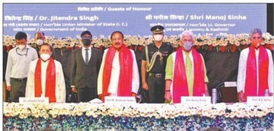
दीक्षांत समारोह में मौजूद उपराष्ट्रपति वेंकैया नायडू, राज्यमंत्री डॉ. जितेंद्र सिंह, एलजी मनोज सिन्हा व अन्य।

उप-राष्ट्रपति से डिग्रियां पाकर होनहारों के चेहरे खिले उठे। पारंपरिक वेशभूषा में मास्क पहने इन मेधावियों के लिए नौ अप्रैल