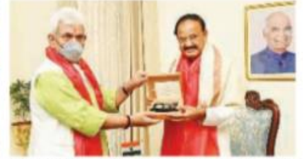
उपराष्ट्रपति वेंकटराव (दाएं) को सम्मानित करते उपराष्ट्रपति मंडल सिना। * जगत