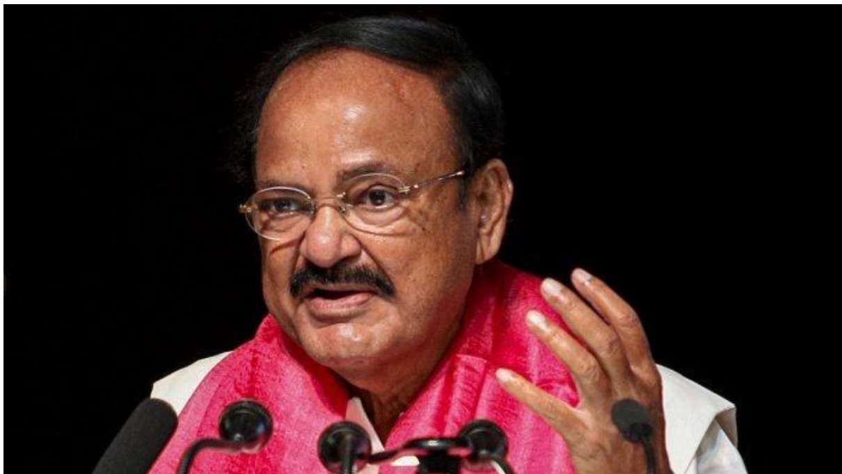
Vice President Venkaiah Naidu.

PTI, Jammu, APR 09 2021, 16:34 ISTUPDATED: APR 09 2021, 16:47 IST