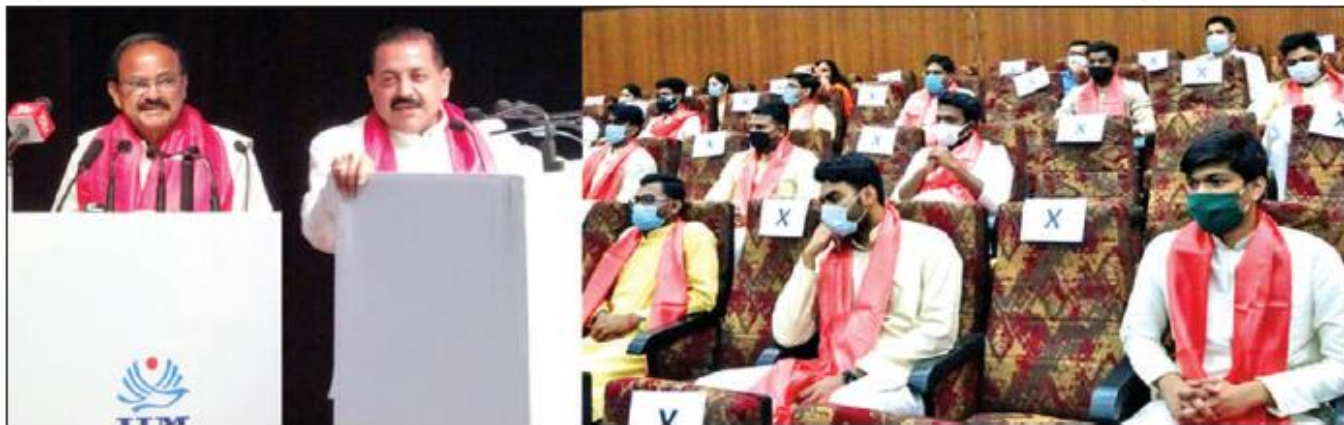
Vice President, M. Venkaiah Naidu and Union Minister Dr. Jitendra Singh addressing 3rd & 4th Convocation of IIM Jammu.

J&K becomes educational hub of North India: Dr Jitendra