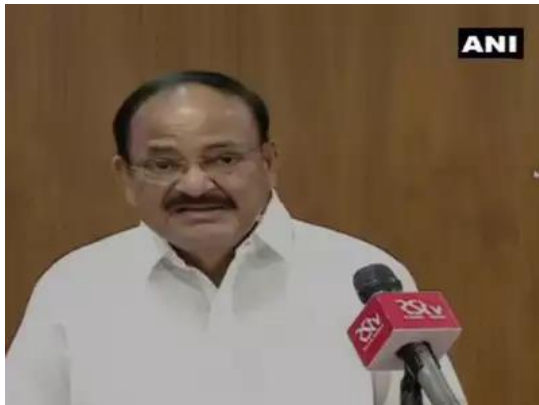
Vice President M Venkaiah Naidu

JAMMU: Vice President M Venkaiah Naidu on Friday called upon national institutions like IIMs to offer innovative courses and diplomas based on new market realities and demands of the fourth industrial revolution.