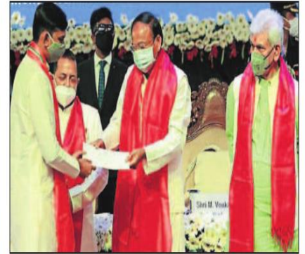
Vice-president M Venkaiah Naidu presenting awards to an IIM student during the convocation ceremony as J&K L-G Manoj Sinha looks on, in Jammu on Friday.