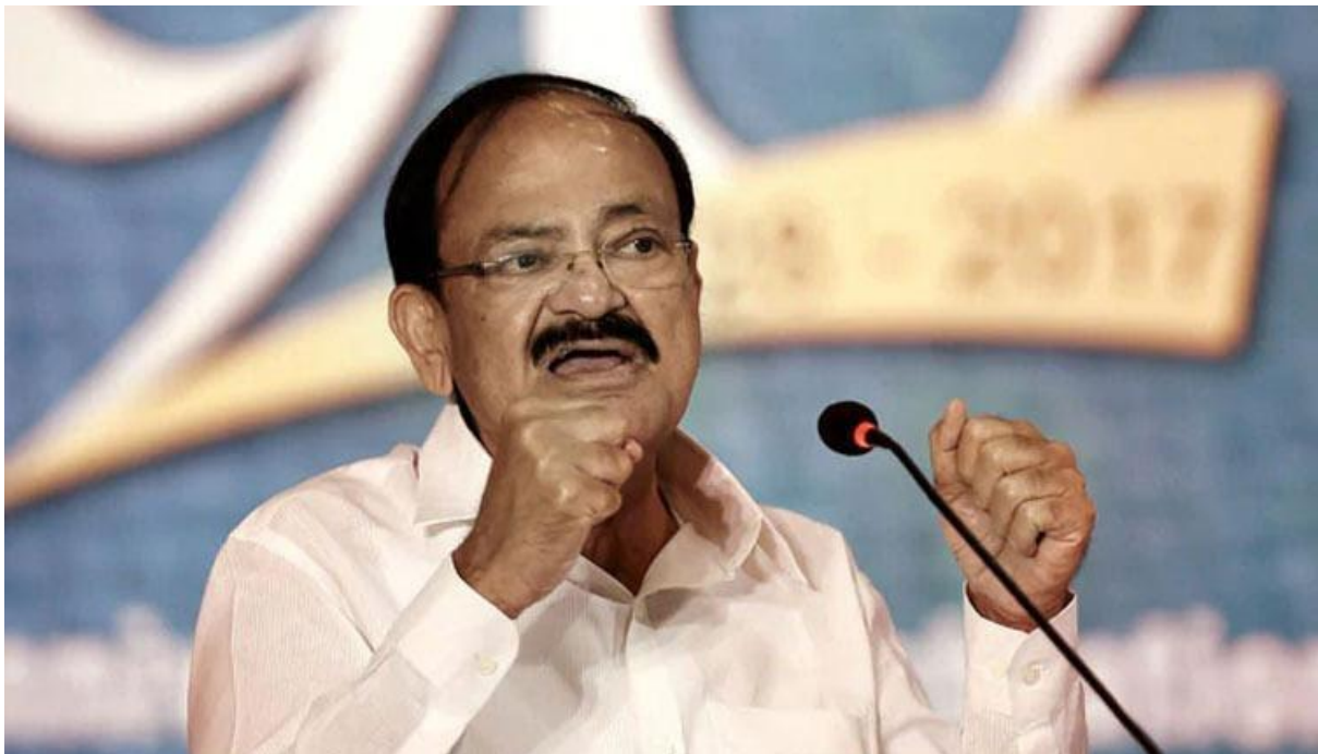
Vice President M Venkaiah Naidu

Jammu: Jammu and Kashmir is an integral part of India and the country is capable of solving its own problems, Vice President M Venkaiah Naidu said here Friday, asking other nations to “confine themselves to their domestic problems” rather than giving unsolicited advice to India.