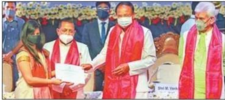
जम्मू में आईआईएम के दीक्षांत समारोह में छात्रा को डिग्री देते उपराष्ट्रपति।

जम्मू कनाल रोड स्थित कन्वेंशन हॉल में समारोह में उप राष्ट्रपति ने उच्च शिक्षा को नई दिशा की ओर उन्मुख करने की जरूरत पर बल दिया। नवाचार और संस्थागत सुधार के लिए प्रोत्साहित करने के साथ रचनात्मकता को बढ़ावा देने के लिए कहा। छात्रों को संबोधित करते हुए उन्होंने कहा कि हमें ऐसा काम करना होगा, जिससे समाज के हर तबके के जीवन में बदलाव आए। उन्होंने कहा कि जम्मू-कश्मीर प्राचीन काल से ही शिक्षा के एक महत्वपूर्ण केंद्र के रूप में जाना जाता है। इस धरती ने पंतजलि, आनंदवर्धन, हब्बा खातून