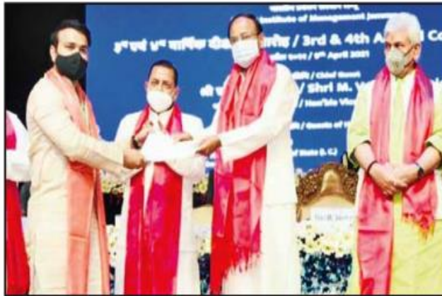
Vice President M Venkaiah Naidu along with Union Minister Dr Jitendra Singh and Lt Governor Manoj Sinha awarding degrees to pass-outs during convocation of IIM Jammu on Friday.

"Jammu and Kashmir has been and will continue to be an integral part of India and the country is capable of solving its own problems. Other nations should confine themselves to