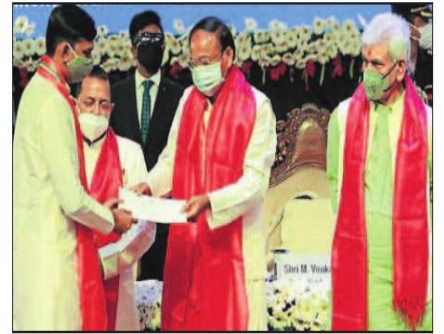
Vice-president M Venkaiah Naidu presenting awards to an IIM student during the convocation ceremony as J&K L-G Manoj Sinha looks on, in Jammu on Friday.