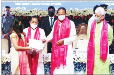
Vice President M Venkaiah Naidu and Union Minister Jitendra Singh during the 3rd and 4th annual convocation of Indian Institute of Management at Convention Centre in Jammu.

On his first Jammu and Kashmir visit since the August 2019 abrogation of Article 370, he said, without naming any country or individual, some people from the neighbourhood always try to create prob-