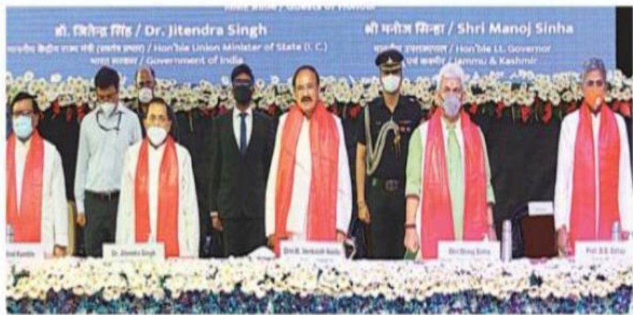
मंच पर उपस्थित उप-राष्ट्रपति वैकेया नायडू, उपराज्यपाल मनोज सिन्हा और अन्य।

इस अवसर पर उपराष्ट्रपति ने कहा कि जम्मू-कश्मीर भारत का अभिन्न अंग है व इस बारे में हमें