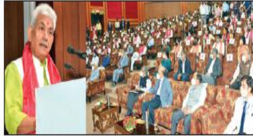
LG Manoj Sinha addressing 3rd & 4th Convocation of IIM Jammu on Friday.

Addressing the 3rd & 4th Convocation of Indian Institute of Management, Jammu here at Convention Centre, Naidu stressed on the need for re-orienting higher education in tune with the realities of the world. He also underlined the impor-