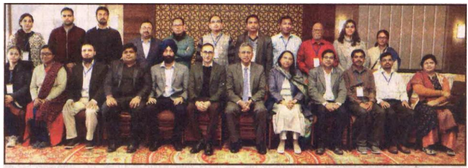
Participating faculty members and guests during inaugural function of PDT at IIM Jammu.