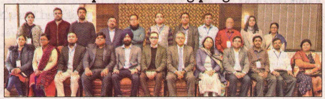
IIM Jammu officials and other dignitaries posing for a photograph.